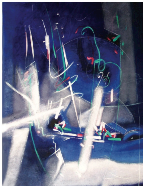
Rubino Dancing. "Rubino ballando", 2004 Oil on canvas, 99 x 79.5 cm